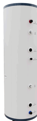
Caelio SR 200 HP