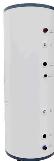
Caelio SR 300 HP